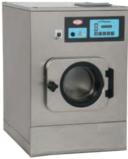
MWR16X5 with E-P Express® control

Milnor's value-priced MWR-Series washer-extractors range in capacity from 25-60 lb. (11-27 kg). Available in three controls, the MWR-Series offers savings and flexibility—without compromising the wash quality you expect from a Milnor.