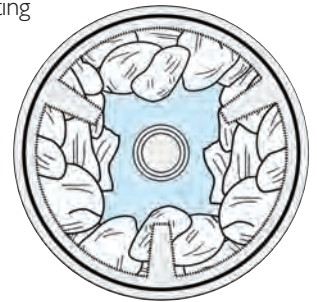
*E-P Plus® only.

5 Milnor's cylinders have efficient inverter drives that produce three speeds for optimum washing.* Three speed washing (along with higher ribs) allows for optimum mechanical action factor (M.A.F.). The distribution speed prevents vibration during extract by evenly distributing the goods to the periphery of the basket. This insures optimum moisture extraction and reduces dry times. The final extract speed is keyed towards today's fabrics. Coupled with a big cylinder (which means a thinner layer of goods for water to pass through) and large perforations, you have better extraction in a Milnor.