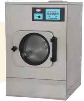
MWR18E4 with E-P One Touch® control

Milnor's value-priced MWR-Series washer-extractors range in capacity from 25-60 lb. (11-27 kg). Available in three controls, the MWR-Series offers savings and flexibility—without compromising the wash quality you expect from a Milnor.