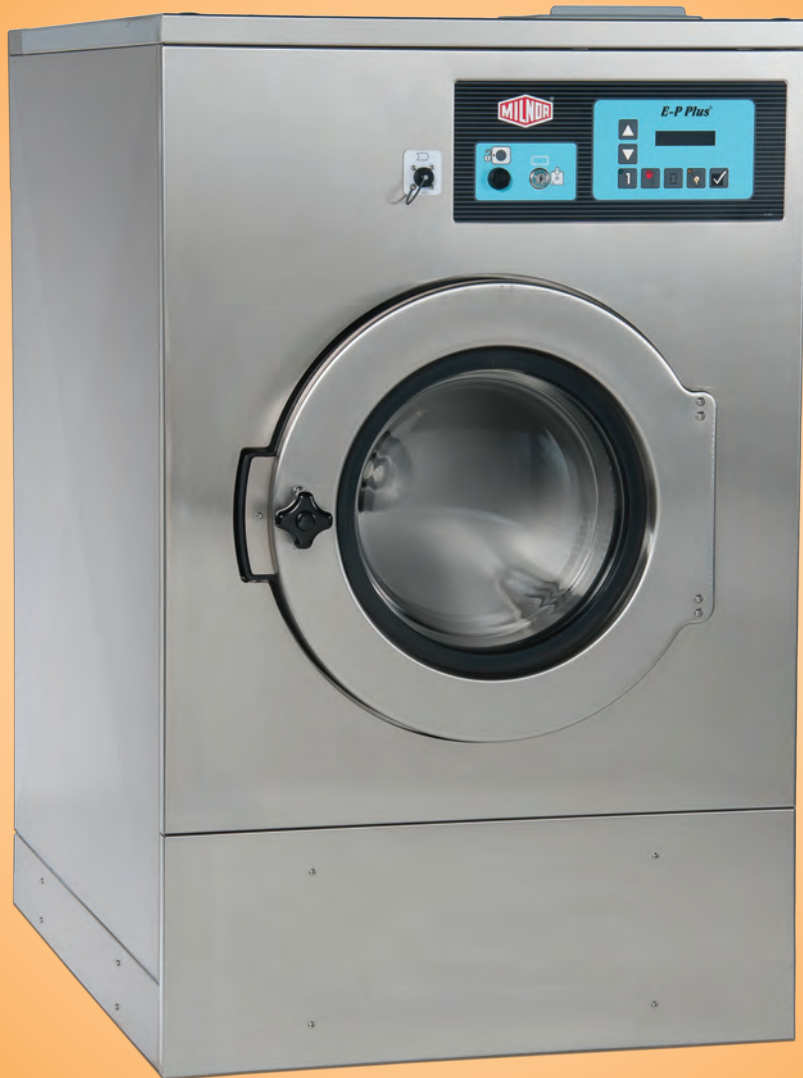
60 lb. capacity model MWR27J5

QUALITY, VALUE, DURABILITY ■ FOUR CAPACITIES ■ EASY-TO-USE CONTROLS